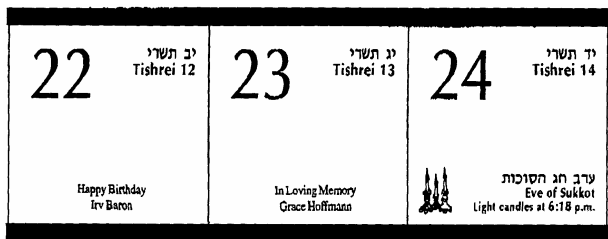
Sample calendar date space

Please make check payable to: Chabad of Peabody * PO Box 2154 Peabody, MA 01960